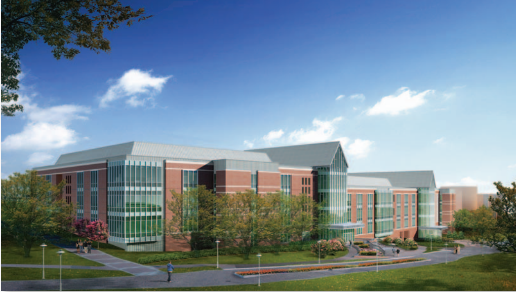
Architectural rendering of CLA, Phases 1 and 2.

Towson, MD: Towson University broke ground in 2007 for a 250,000 square foot College of Liberal Arts (CLA) building to be built in a phased construction schedule. This project represents the university's first entirely new academic building in 30 years with a focus to complement the university's historic structures while setting the standard for future projects with a sustainable, 21st-century design.